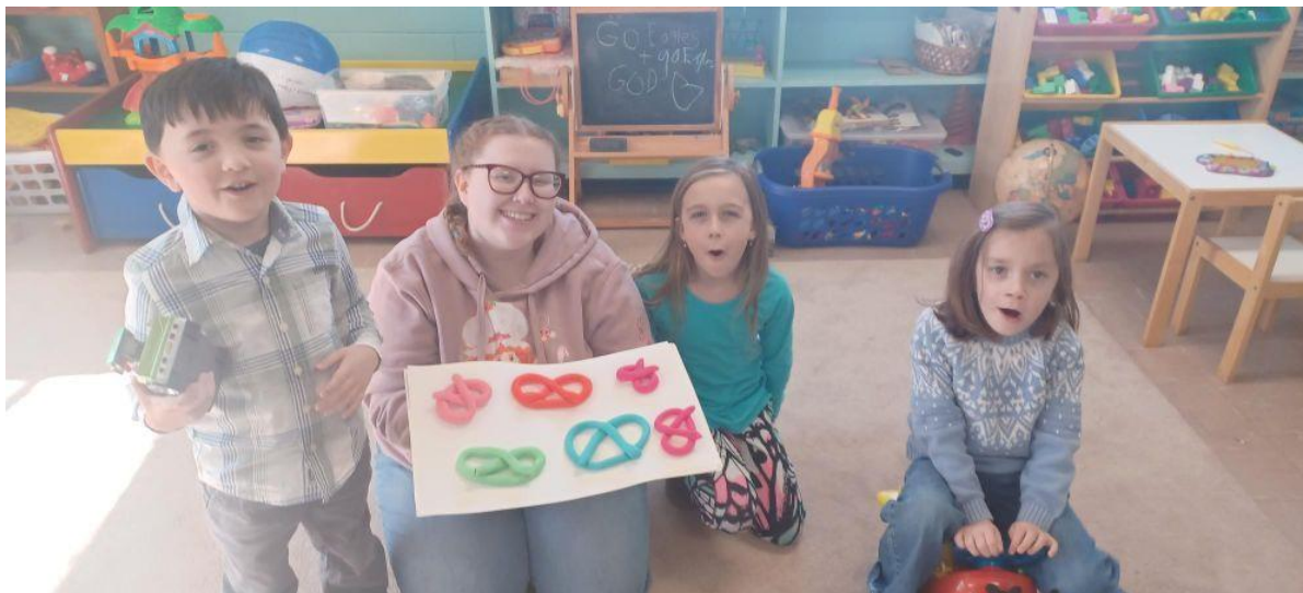
The lesson on February 23 was about the Lord's Prayer. Afterwards we made pretzels out of play doh because pretzels are symbolic of arms folded in prayer.